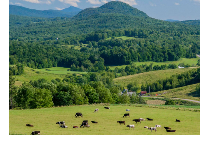
The Vermont landscape illustrates how landform shapes its use.

What makes a landscape scenic? It's 1976, and I have just posed this question to a group of graduate students sitting behind me in a tan 15-passenger Dodge van as we head north into Vermont's hilly agricultural landscape. After some thought, the students begin to offer ideas about what makes the surrounding landscape attractive. At first, their comments focus on taking inventory , listing the elements in the landscape: the mountain ridgelines,