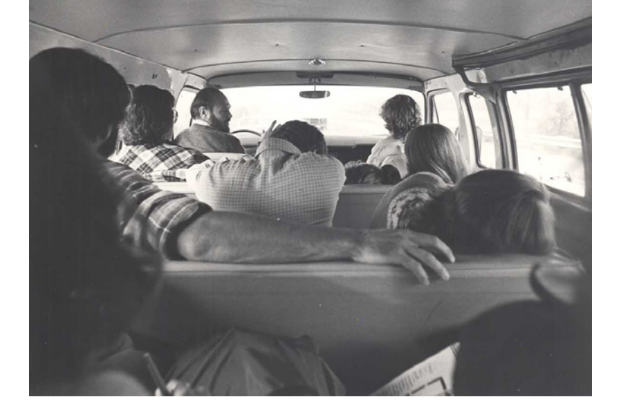
The Conway School van became a mobile classroom for the first ten days of the year.

to challenge students to open their minds, to let go of old assumptions, to see with new eyes the landscape unrolling before them.