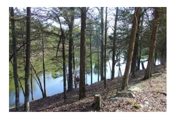
Filtered views of the pond from the knoll (site C) are dramatic, while the wooded hillside protects water quality by slowing runoff.

Four potential building envelopes exclude steep slopes and wetland buffers. Initially, the community had chosen the "High Meadow" site (A), with housing stepping down to the pond. (Dark rectangles illustrate potential leach field locations.)