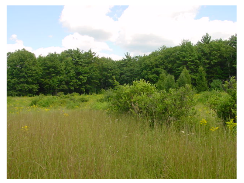
Mature woodlands and open meadow characterize this magnificent site.