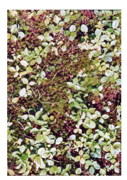
A rich carpet of haircap moss, wintergreen, and star flower typify small glades within the woodlands at Skyfields.