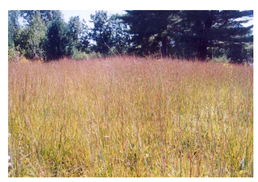
The contrast between mixed woodlands and the open bluestem meadow provides dramatic beauty. Colonizing species such as goldenrod must be managed through controlled burns to preserve bluestem dominance.