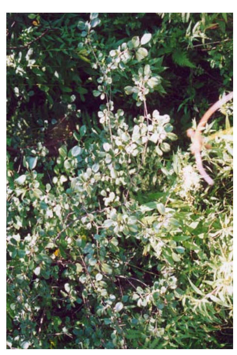
Identifying and eradicating invasive plants such as this buckthorn must be a first step.