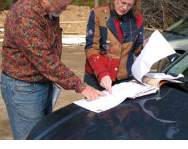
Architectural plans and site surveys, if you have them, are helpful materials to have on hand, as are any images or clippings that express your design preferences.