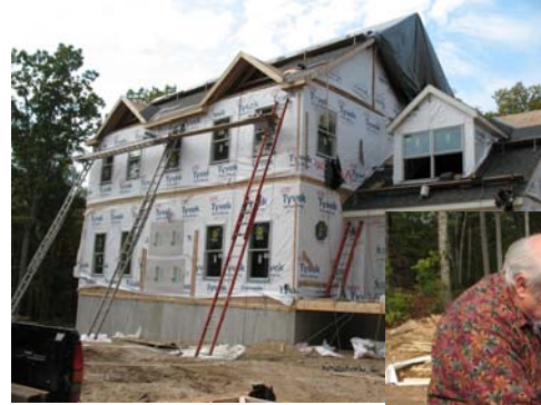
Hiring a few hours of design consultation can be particularly helpful with new construction.