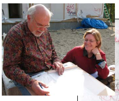
The same design process of careful listening, site reconnaissance, and concentrated design time leads to surprisingly comprehensive recommendations.