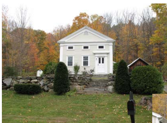
This 1830 Federalist style home has established perennial beds, handsome stone walls, and inviting surrounding woodlands, but lacked cohesion.