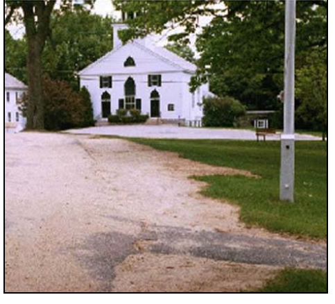
Contemporary challenges undermine the common's integrity. Incremental fragmentation, compacted soils, intensive and inappropriate uses, loss of knowledgeable care-taking, lack of overall design and changes in the surrounding physical and political context threaten the health and vitality of the common.

WCA then compiled the observations and research in a comprehensive citizen guidebook, Common Wealth, which summarizes the history of town commons in Massachusetts, identifies the key threats to them, and outlines a process by which communities can establish a preservation and maintenance master plan.