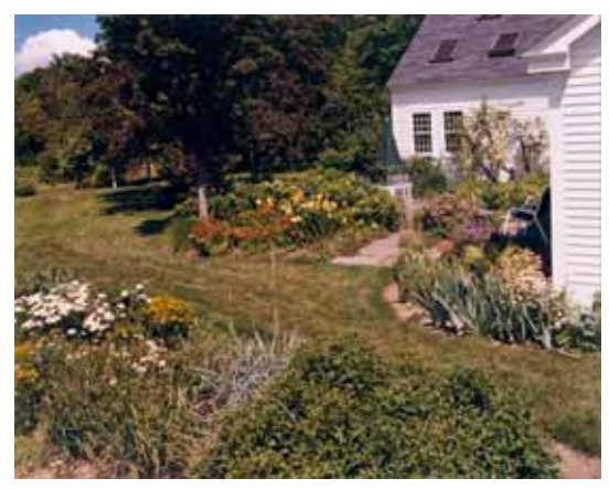
6. Gardens step into the sunny patio. Prime south-facing nook extends dining room to a sheltered corner with outstanding views.