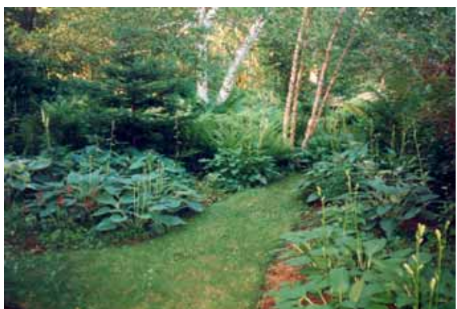
1. The narrow front yard is transformed into an inviting shade garden, with grassy paths meandering through to a gazebo and meadow view beyond.