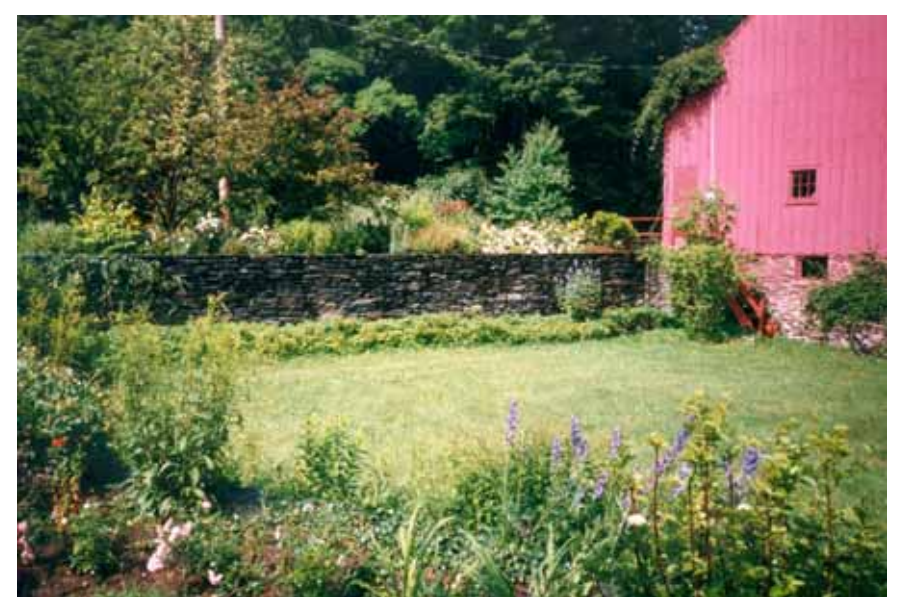
3. Four-season interest engages employees as well as residents while providing a gracious separation between work and home